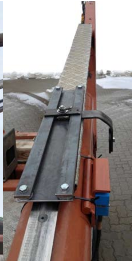
Contactless weighing zone sensor for weight reading